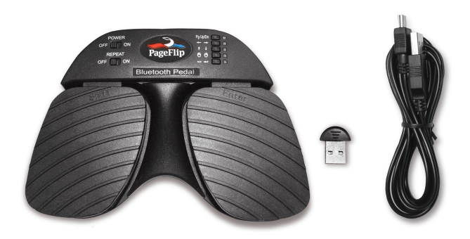
Figure 1: Package contents: PageFlip Cicada and USB power cable.