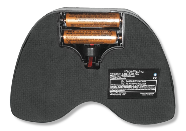
Figure 2: Battery cover is located at the bottom of the PageFlip Cicada. A convenient storage compartment for an optional Bluetooth dongle lies alongside the batteries.

Note: To conserve battery power, turn off device when not in use. The unit automatically turns off after 30 minutes of inactivity, but can awake instantly upon a pedal tap. Pedal versions prior to V5 have a timeout period of 10 minutes, rather than 30 minutes.