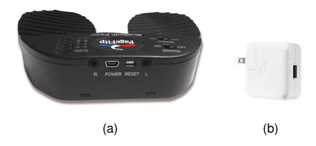
Figure 3: (a) Rear view of PageFlip Cicada. Attach the mini-USB end of the 6' USB power cable into the rear POWER outlet and connect the other end into (b) any USB AC adapter, such as those found on iPads and iPhones.

In addition to being battery-operated, PageFlip Cicada may also be plugged into the wall via a USB AC adapter. For added versatility, the pedal may be powered by connecting it directly to the USB port of a computer. A USB power cable (Fig. 1) is included for use with any USB AC adapter, such as those included with iPads and iPhones (Fig. 3(b)). Simply plug one end of the power cable into the mini-USB outlet on the rear of the PageFlip Cicada (Fig. 3(a)) and plug the other end into the USB AC adapter.