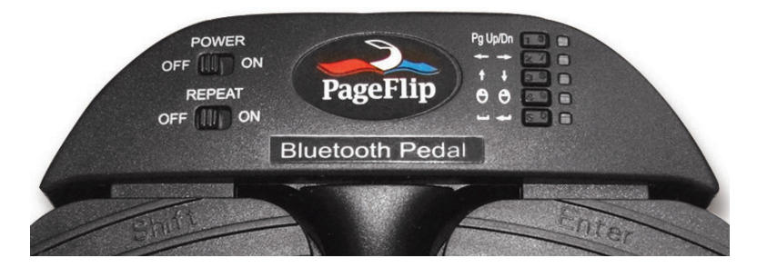
Figure 4: Top view of PageFlip Cicada control panel.